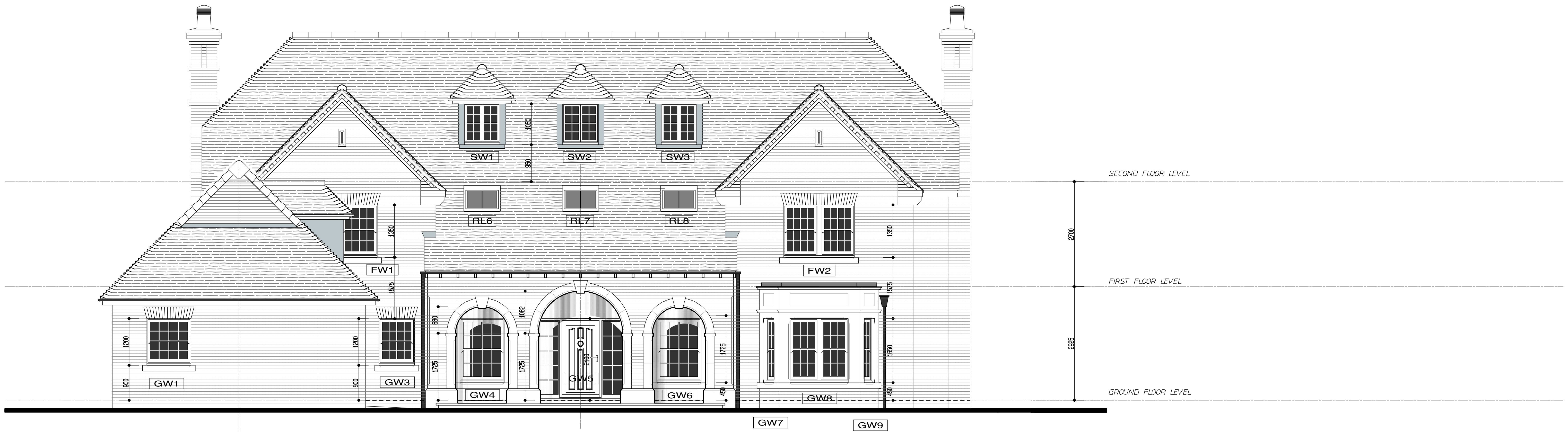
FRONT (NORTH) ELEVATION